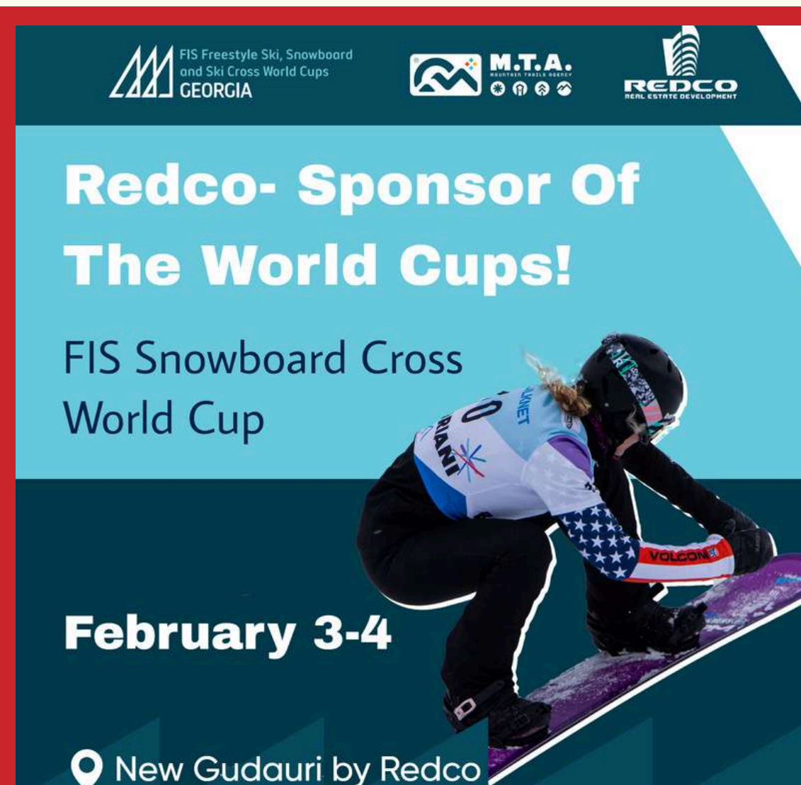
WORLD CUP CHAMPIONSHIPS ARE HELD ON OUR TERRITORY