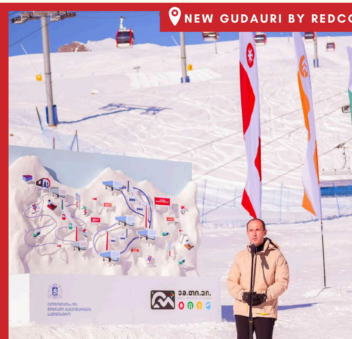
VICE-PREMIER OF GEORGIA OPENING WINTER SEASON OF 2023-2024